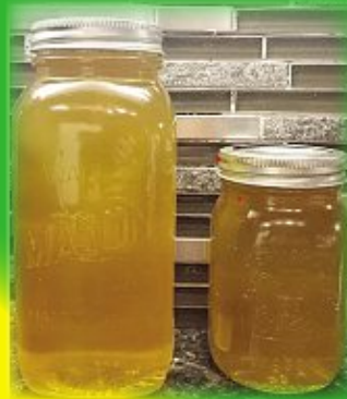
HONEY Produced from our very own plants now available!

be our many satisfied customers. It has been the foundation of our success and we will continue to build on it. We have many repeat customers from all over Ontario and look forward to seeing them again every year.